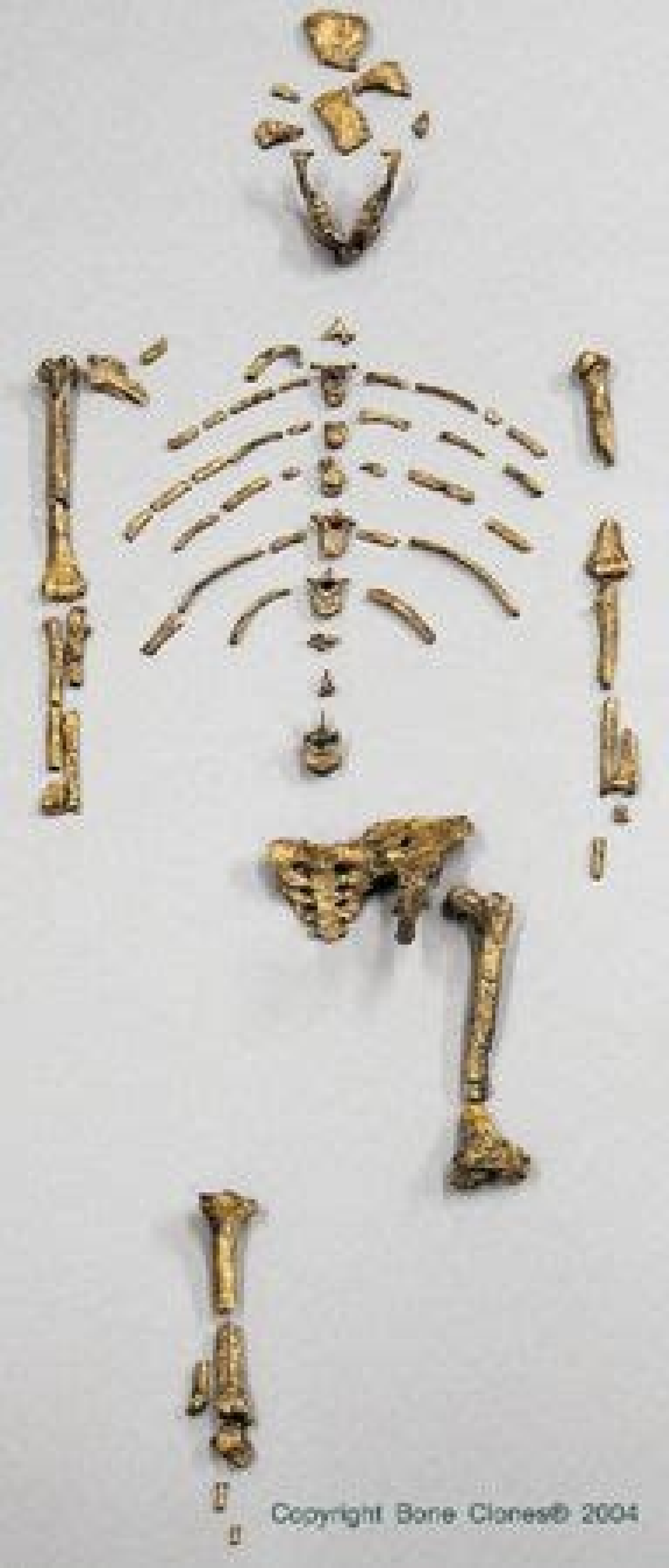
Información sobre Lucy la Australopithecus. Información de Lucy Australopithecus.